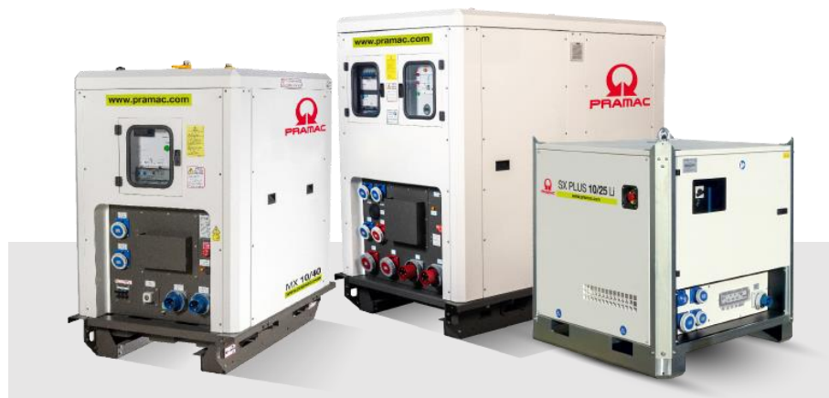
Off Grid Battery Energy Storage Solutions

This is what makes them so competitive: at a lower total cost, it is possible to increase sustainability, reaching two targets with one highly performing solution.