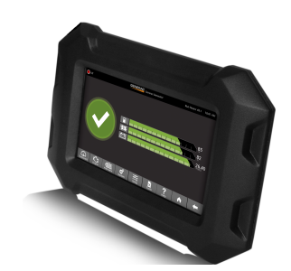
Power Zone® Controller